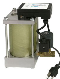
Energy Efficient Zero-Loss Drain Electric Automatic Condensate Drain