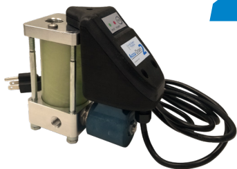
Small Lightweight Zero-Loss Drain Zero-Loss Drain with Internal Posi-Valve